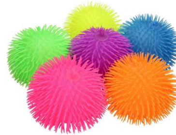
Elastic ball (hair density)