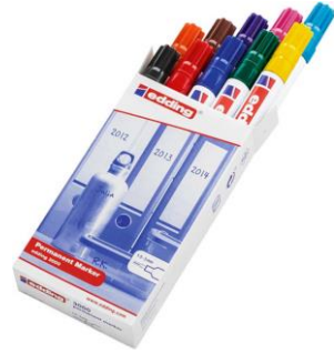
Permanent marker set